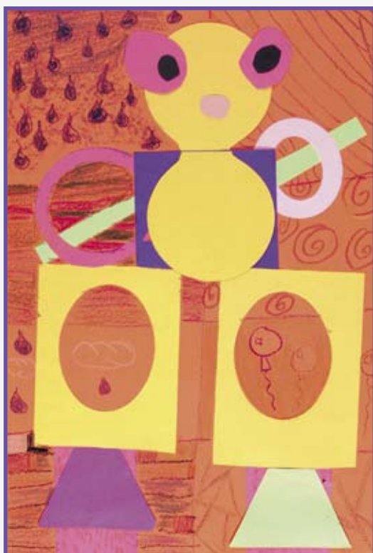
Mint Chaisomboon Mixed Media, "Untitled"